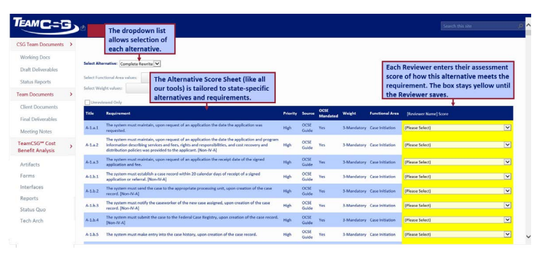
TeamCSG<sup>™</sup> Cost Benefit Analysis: Alternatives Score Sheet

Designed to bring efficiencies to the Feasibility Study processes and ensure the accuracy and efficacy of the data and information collected. Supports our team in collecting and analyzing the status quo environment, documenting the needs assessment, presenting a detailed set of alternatives for your team, and facilitating the analysis to develop a list of viable alternatives for consideration during the Cost Benefit Analysis activities.